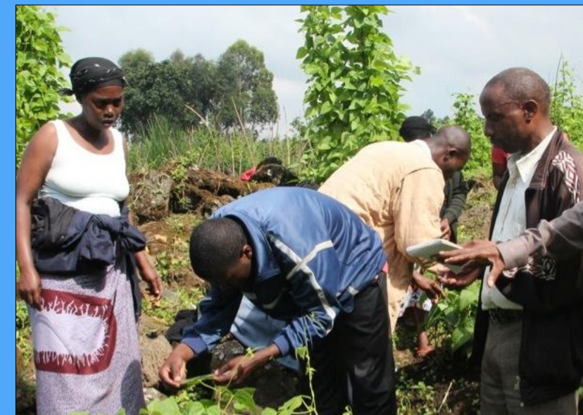
FFS PLOT - FFS group

FFS group members get a deep understanding of crop production through observation & analysis in the FFS plot